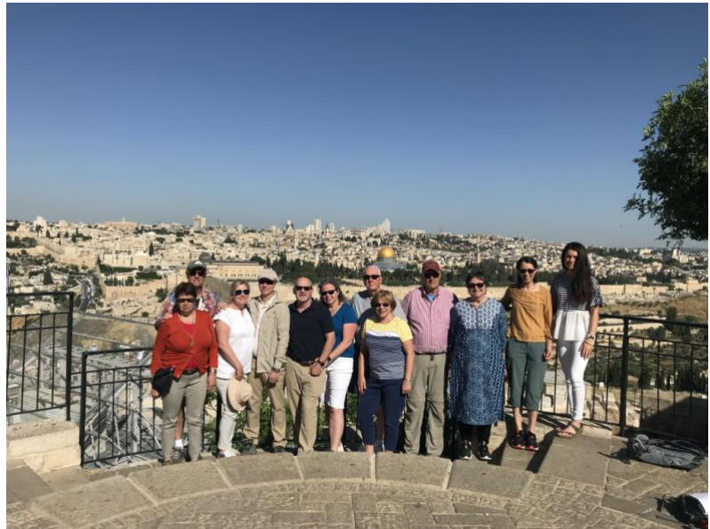
Standing atop the Mount of Olives Looking down on Jerusalem and Kidron Valley