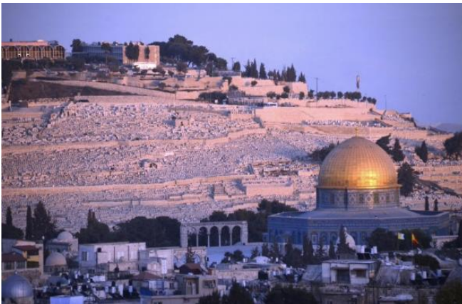
Mount of Olives from Jerusalem, across the Kidron Valley