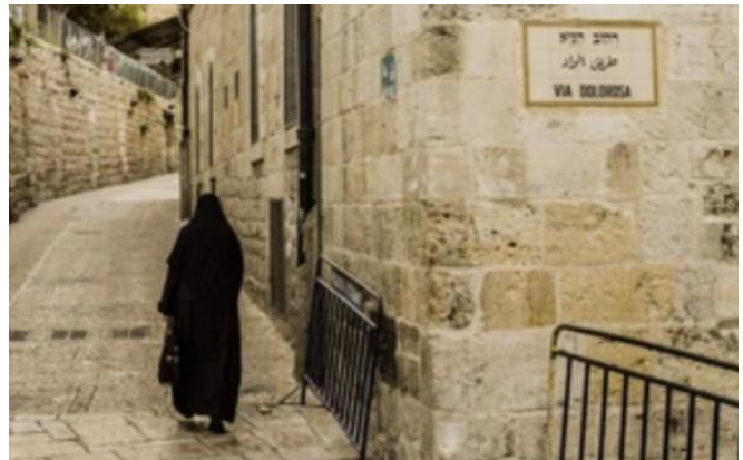
The streets of Jerusalem - Via Delorosa