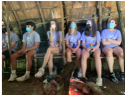
Listening to historical native life in a Long House on the Shinnecock Reservation in Washington, CT. We highly recommend a visit to this museum!