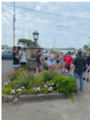
Touring Southport and learning all about the ending of the Pequot War.