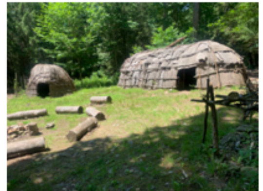
Replica of the Shinnecock Village at The Institute For American Indian Studies Museum.