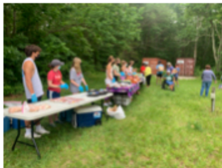
Food Giveaway on the Eastern Pequot Reservation. We met some wonderful people we will never forget.