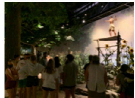
At the Mashantucket Pequot Museum where we spent the day learning all about the daily life of Pequot Indians.